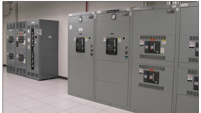
Figure 3. A portion of one of two electrical rooms at MDC showing redundant breakers, UPS units with maintenance bypass switches to isolate A and B circuits when needed.