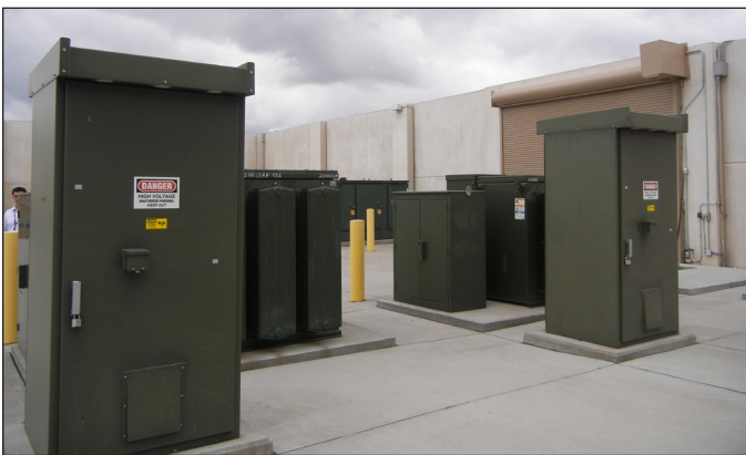
Figure 1. Utility power from two independent substations enters the data center through an automatic throwover switch, from which it is fed to two 4000-A, 13.8 kV – 480 V transformers, each of which can supply the entire center if needed. 480 V power is fed to the data center as independent and redundant A and B circuits. Each circuit comes off a separate power distribution unit (UPS) and a separate uninterruptible power supply (UPS), backed up by battery farms inside the structure.

MDC receives its primary 12-MW, 13.8 kV power via direct paths to two Omaha Public Power District substations. Upon entering the site, the feeds first pass through an automatic throwover switch. Should one power source leg fail, the switch automatically transfers power to the other leg. Each output leg from the ATO feeds one of the center's two 4,000-A, 13.8 kV – 480 V step-down transformers, Figure 1 , each of which can satisfy the center's entire load. A third transformer will be added as the center expands.