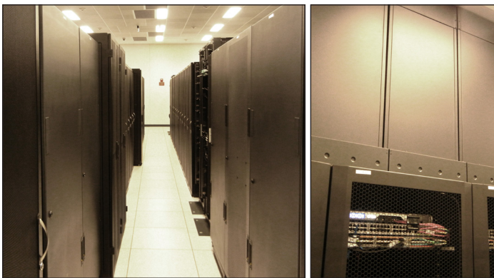
Figure 5. Power density ranges from 3,000 W/sq ft to 6,000 W/sq ft in plenum-cooled aisles (left), but one client requested 20,000 W/sq ft, which CoSentry accommodated by installing "chimneys" above the server racks (upper portion of photo, right). Redundant fans powered by VFDs draw heat from the chimneys based on air pressure and temperature.

"Power density is 150 W/sq ft on the data center floor," notes Mr. Capps. We're shooting for 3,000 W/cabinet in a 5,000 sq ft suite. That's 250 cabinets. We can add as much power as needed through UPS units, but the real issue is how to extract the heat. We can take our racks to 6,000 W, and we don't have any problem with that, either with power or cooling. We actually have one client who needed 20,000 W/cabinet, and we handled that by closing off the back of the racks and venting the trapped heat through a chimney. The chimneys have redundant fans that are driven by VFDs so they can ramp up and down based on the air pressure and temperature inside the cabinets, (Figure 5) .