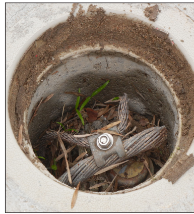
Figure 9. This 20-ft copper-clad deep-earth electrode serves as the single point at which all elements of the data center's interior and exterior grounding systems ultimately terminate. The 500-MCM bare copper grounding conductor seen at the top connects with the MGB inside the structure. MDC annually inspects and maintains the electrode to ensure a maximum earthing resistance of four ohms. Resistance measured two ohms are the center's most recent re-commissioning.

Leading to the electrode is a 500-MCM bare copper grounding conductor that runs underground from the main grounding bar (MGB) located inside the center. Additional 500-MCM copper runs from the MGB to each continuing grounding bar, one of which is shown in Figure 8 .