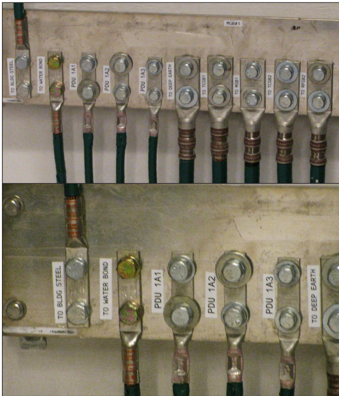
Figure 8. The main grounding bus for the #1 data room in the MDC (upper photo) bonds conductors from all system elements in that room. Note that all leads are labeled for ease of maintenance. The close-up (lower photo) shows leads from building steel, the water system and various PDUs, as well as the outgoing lead to the deep-earth electrode.

buses, and from there to the main grounding bus for that room Figure 8 . Finally, the buses, along with all exterior system elements, including the ground ring surrounding the structure and the lightning-protection electrodes on the center's roof, are connected to the deep-earth ground.