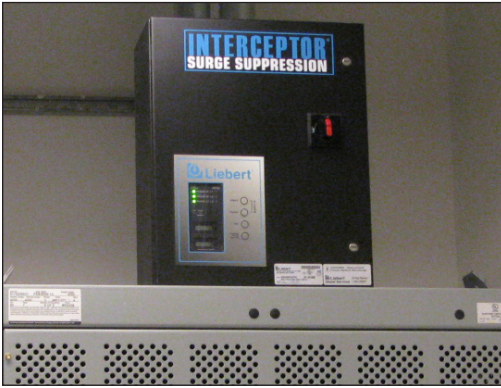
Figure 4. Two surge suppression devices, one atop the cabinet and one (labeled TVSS) on the cabinet's upper shelf, protect equipment against voltage irregularities.

A and B circuits are delivered to separate remote power panels (RPPs) located at the ends of data aisles, A on one end of an aisle and B on the other, with 24 cabinets between. Sub-floor cables from the RPPs feed the server racks. Cables are sized at a minimum of #10 AWG, which is one size larger than that required by the National Electrical Code (NEC) for 20-A service. In fact, most circuits on the raised floor are rated at 30-A, for which CoSentry uses #8 AWG cable. "It's all about heat re-distribution with the larger-gage wiring", explains Scott Capps, CoSentry's Central Region Facilities Manager.