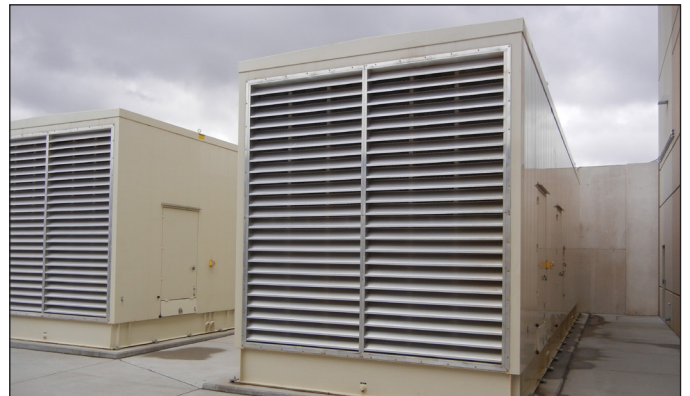
Figure 2. Two emergency back-up generators, housed in tornado-proof enclosures, are rated at 2.5 MW and 2.25 MW, respectively. Each is sufficiently sized to power the entire center for three days with installed fuel reserves. A third generator is scheduled for installation in late 2014.

Power enters the data center structure through two electrical power rooms. Each room serves one of the center's two 5,000-sq ft data suites. The power rooms house the building's two service entrances, each rated at 4,000-A including a 4,000-A entrance for the emergency generators. Each room also has one 750-kW UPS rated at a less than 12 second response time. The UPSs are backed up by seven minutes battery power (generators spool up in 12 seconds). Also in the power rooms are three 800-A PDUs. Surge suppression devices (SSDs) protect circuits against unanticipated changes in circuit potentials, Figure 4 . Each of the PDUs has an 800-A static switch to alternate between power sources. The primary sources are the UPSs in the power rooms; the second, redundant source is a catcher UPS located in another part of the building. It is sized to run the entire building and takes over when there is an issue with the PDUs. Power transfer takes less than four MS, which is faster than any computer on the data floors can see. Switches also enable circuits to be isolated when needed, such as for maintenance.